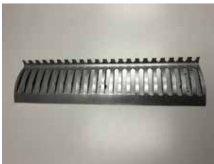
(1) Shaft Holder