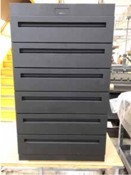
Locking Demo Cabinet