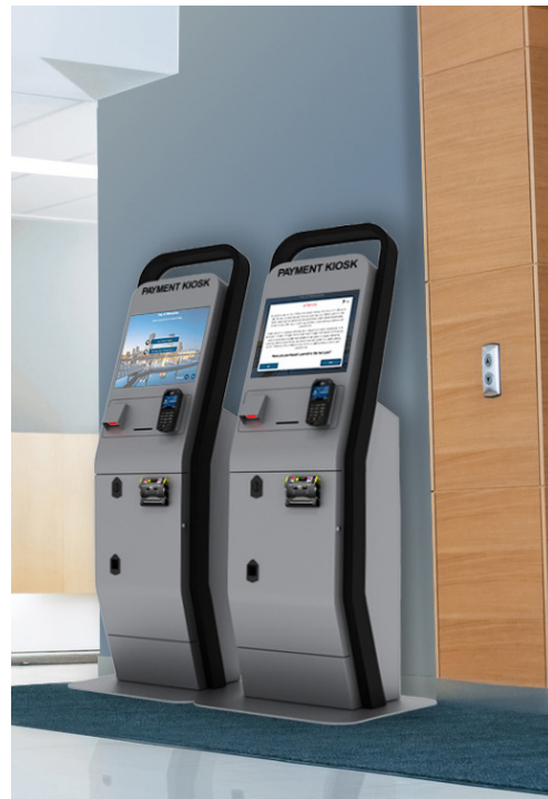
Bill payment kiosks